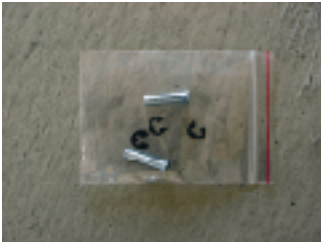
Tracker & Step-Through E Pin Pack Contains instructions & all fasteners for fitting of all Tracker / Step-Through Control Handles Order Code 20SM-TSEP00