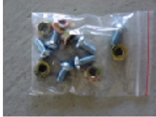
Fastener Pack 10mm - All StockMaster Fixed Platforms Contains instructions and all fasteners for fastening of Platform & Tube Braces to Frames Order Code 20SM-CPF10