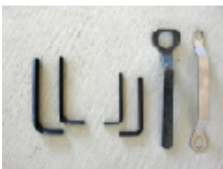
StockMaster Tool Pack Contains all tools for Stockmaster assembly. Hexagon Keys (4 sizes) and Spanners Order Code 20sm-TSWA00