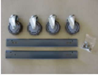
Navigator Castor Set Includes 4 castors, Mounting Brackets, instructions & all fasteners for fitting of Castors Order Code 20SM-NAC00