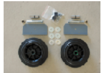
Tracker / Step-Through Wheel Assembly 200 mm Wheels and Antitilt assembly complete with fastenings Order Code 20sm-TSWA00