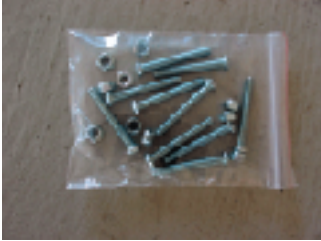
Platform Fasteners 6mm - Step-Through Contains instructions and all fasteners for fastening of Platform Safety Railing and Hand Railing. Order Code 20SM-STF06