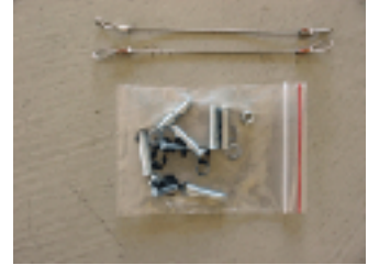
Navigator/Lift-Truk E Pin Pack Contains instructions & all fasteners for fitting of Navigator / Lift-Truk Control Handles Order Code 20SM-NWEP00