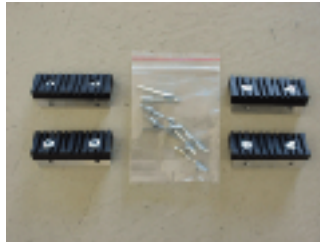
Rubber Foot Flat Pack of 4 with Mounting Brackets and Rivets for all StockMaster models prior to July 2008 Order Code 20SM-RFA00