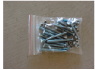
Platform Fasteners 6mm - Navigator/Tracker/Lift-Truk Contains instructions and all fasteners for fastening of Platform Safety Railing and Hand Railing. Order Code 20SM-NTLF06