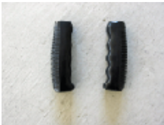
Rubber Hand Grip Pack of 2 for all StockMaster Control Handles. Order Code 20SM-RHG00