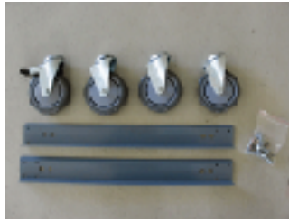
Lift-Truk Castor Set Includes 4 castors, (1 Directional Lock) Mounting Brackets, instructions & all fasteners for fitting of Castors Order Code 20SM-LTC00