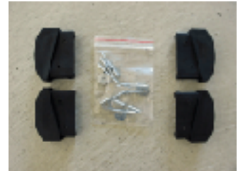
Rubber Foot Rounded Pack of 4 with Washers and Rivets for all StockMaster models post July 2008 Order Code 20SM-RFA01